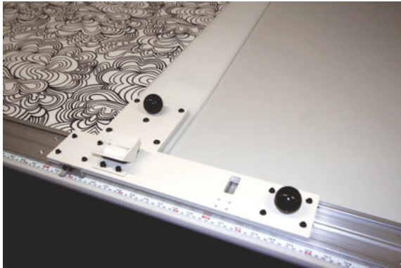
T-bar with adjustable brake and holder for tube - available only in black